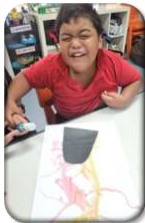
Jiraiya enjoying Art