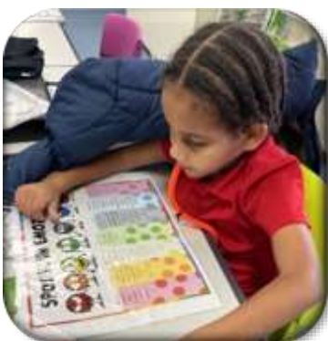
Benel choosing how she is feeling