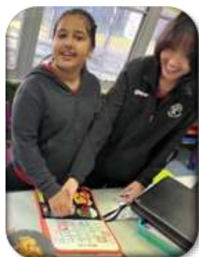
Ayeza enjoying a matching activity